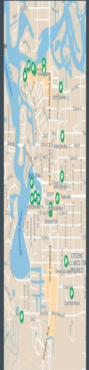
PUBLIC ART LOCATION GUIDE