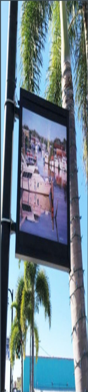
ILLUMINATED ART BOXES