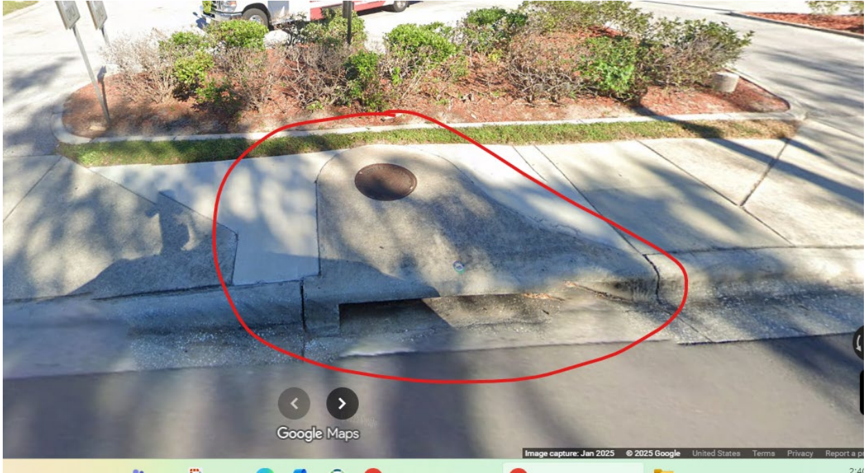
5. 401 E. Marting Luther King, Jr. Drive – in front of Union Academy Family Center