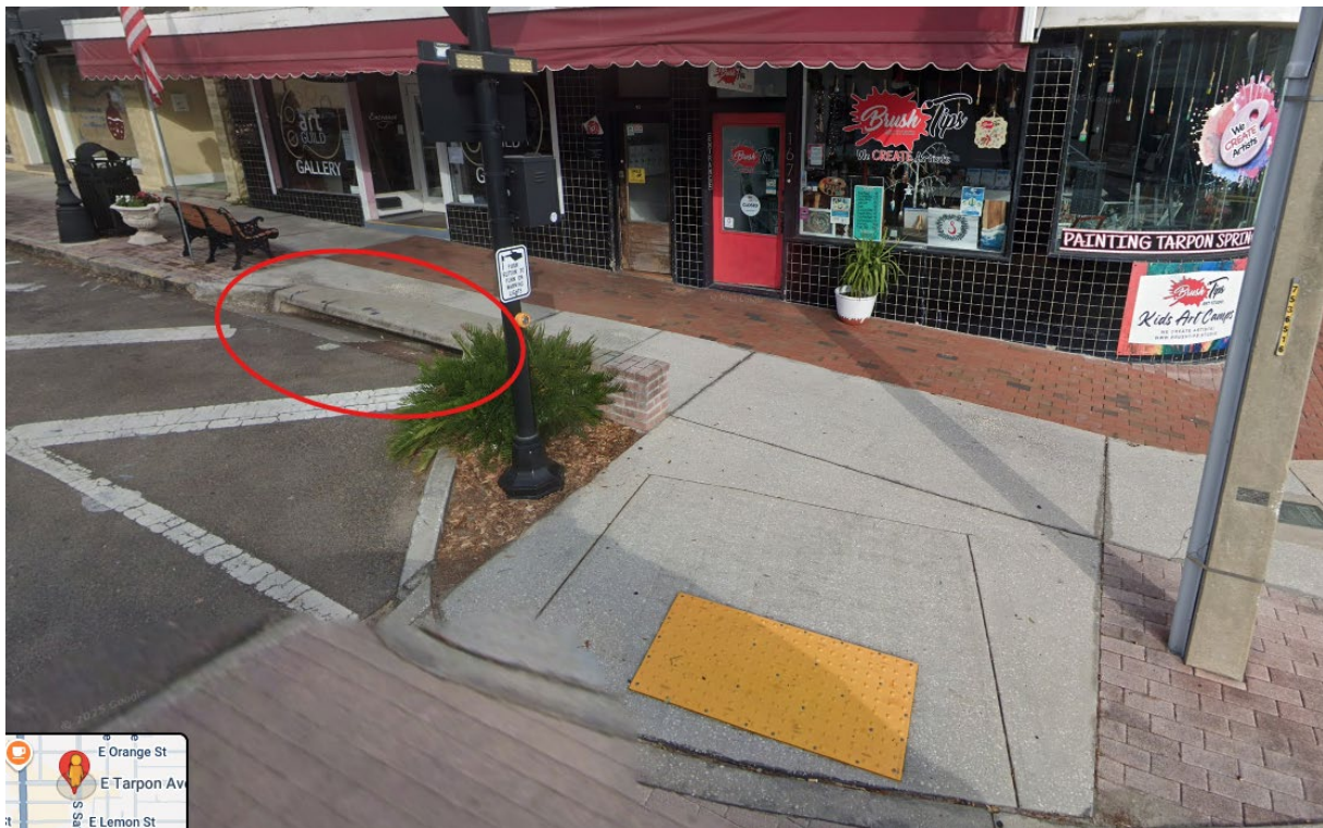
2. 167 E. Tarpon Avenue