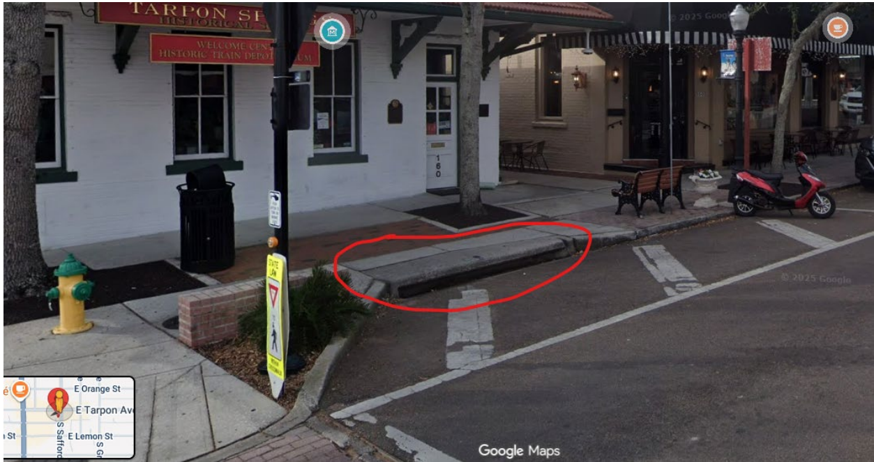
1. 160 E. Tarpon Avenue