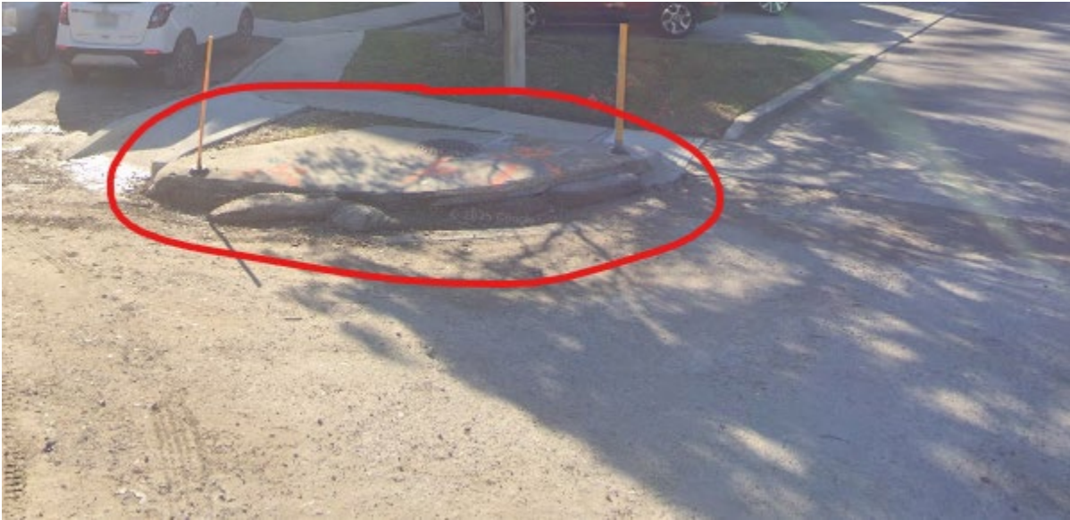
8. Pine St & N. Grosse, SW corner on City Hall side (Stormwater & Sustainability have an idea to use this location for a City Staff design competition to build interest and engagement within staff)