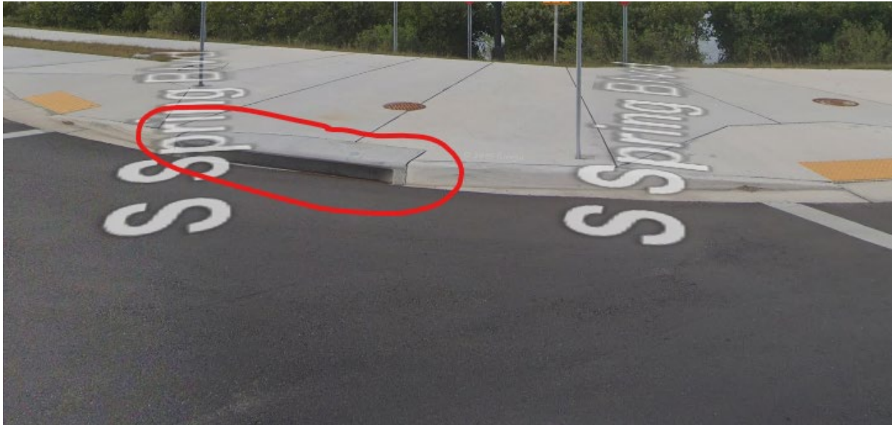
7. W. Martin Luther King, Jr. Drive & S. Spring Blvd/Whitcomb Blvd., West side