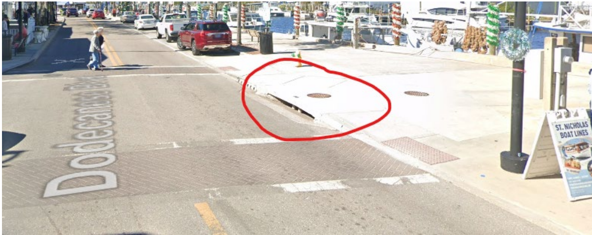
3. Dodecanese and Athens St. (if concerns, see alternate option below)