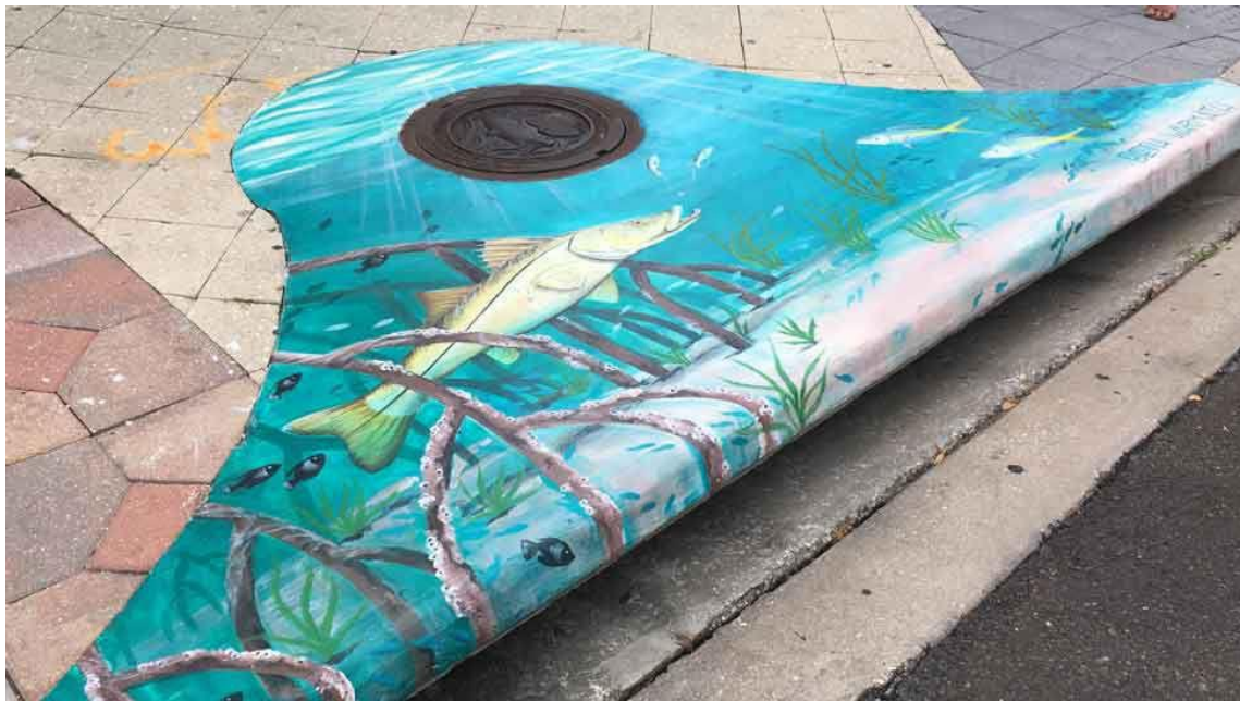
Example photo from: City of Clearwater Storm Drain Mural Program

Deadline: Tuesday, October 1, 2024, 3:00PM Project Location: The City of Dunedin