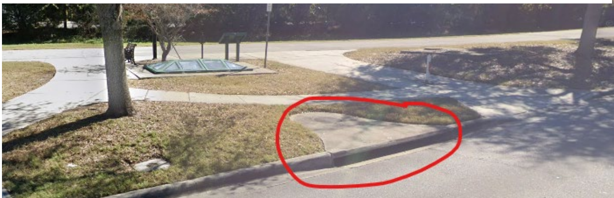
4. Safford Ave. & E. Spruce, west of the Stormwater baffle box on East side of Safford