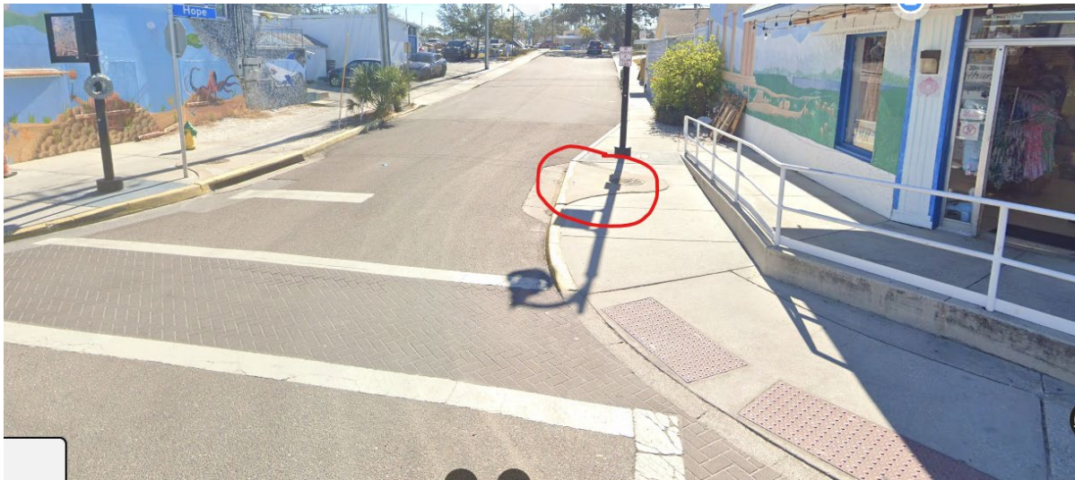
3. Alternate location - Dodecanese and Hope St.